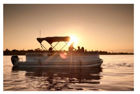
Day 4-7 Tuludi Camp, Okavango Delta